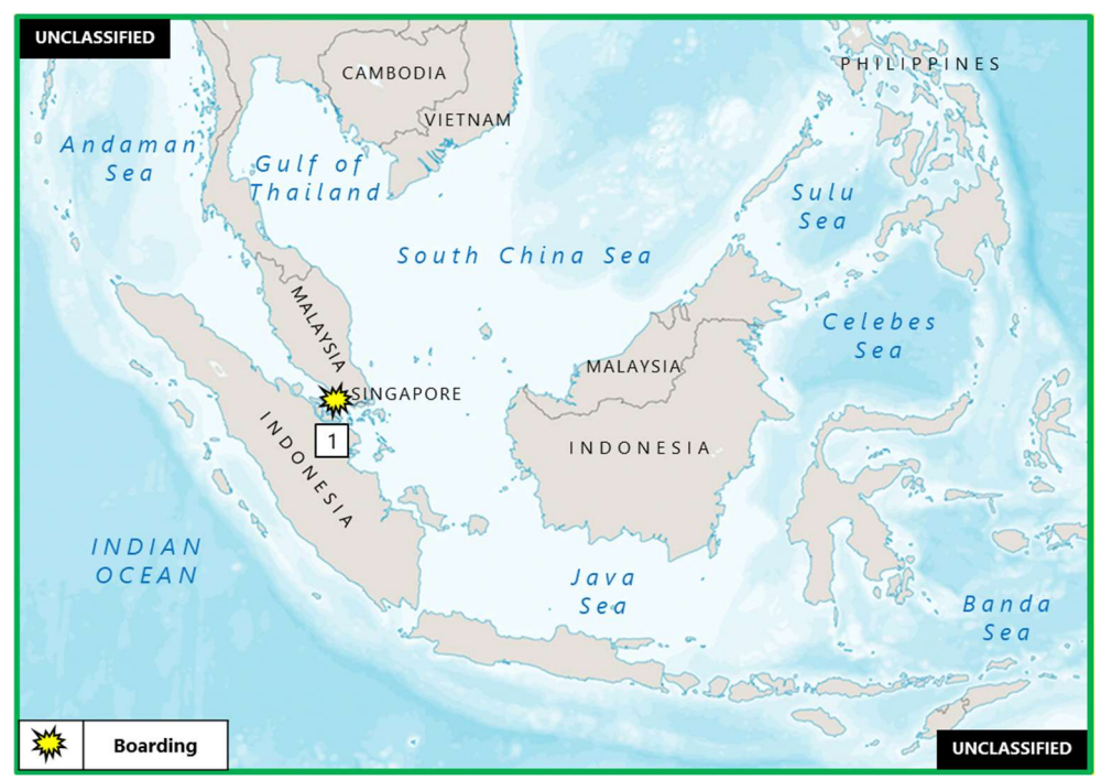
(U) Figure 1. East Asia – Southeast Asia Piracy and Armed Robbery at Sea