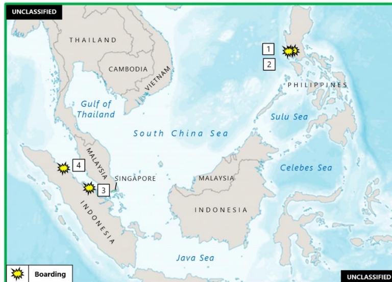
(U) Figure 3. East Asia – Southeast Asia Piracy and Armed Robbery at Sea

1. (U) PHILIPPINES: On 26 November at around 0245 local time, five robbers boarded the anchored Liberia-flagged container ship G CROWN at Manila Bay Anchorage, near position 14:36N – 120:49E. The perpetrators boarded the vessel through the hawse pipe. The duty crew observed the robbers and raised the alarm. The robbers, noting the alerted crew, escaped with stolen ship's properties. The ship informed authorities and a coast guard patrol boat was sent to the vicinity. (IMB; Clearwater Dynamics; vesseltracker.com)