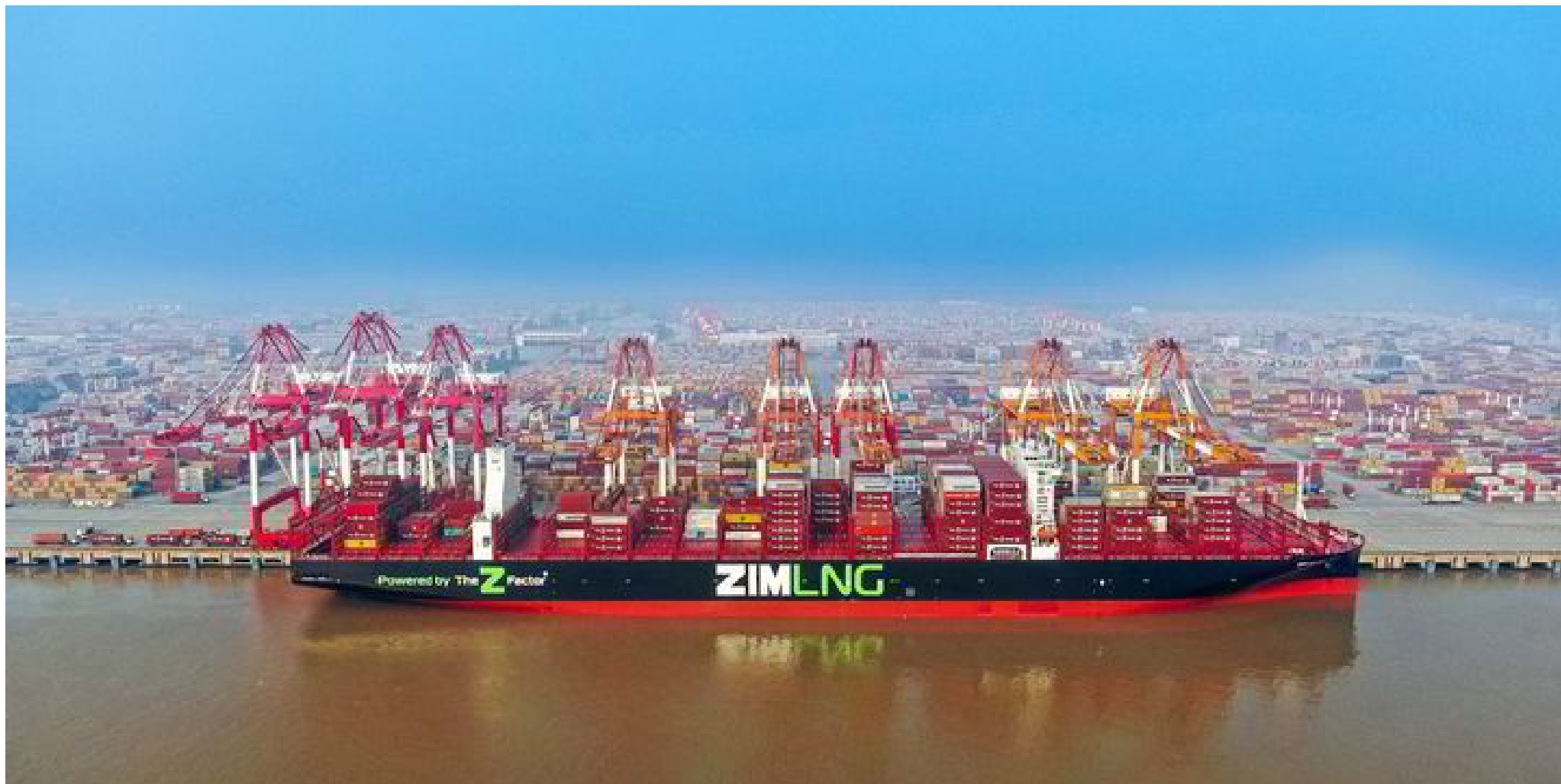
Zim's 15,000-teu dual-fuelled container ship Zim Sammy Ofer (built 2023).