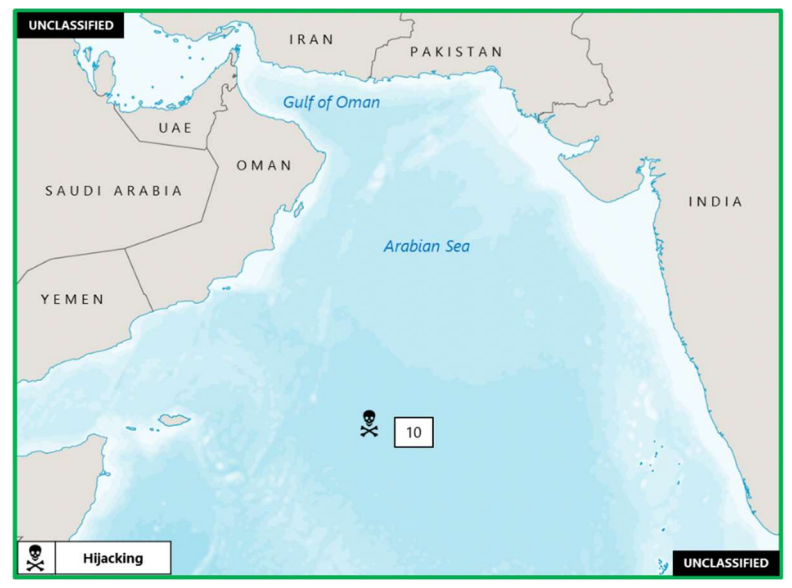
(U) Figure 2. Indian Ocean – East Africa Piracy and Armed Robbery at Sea

1. (U) RED SEA: On 19 December at 0530 UTC, four small boats with as many as five persons onboard each boat approached a vessel 80 NM northeast of Djibouti (exact location not specified). The master described the boats as blue and grey in color. The closest small boat approached to within 0.5 NM of the vessel before moving away. The