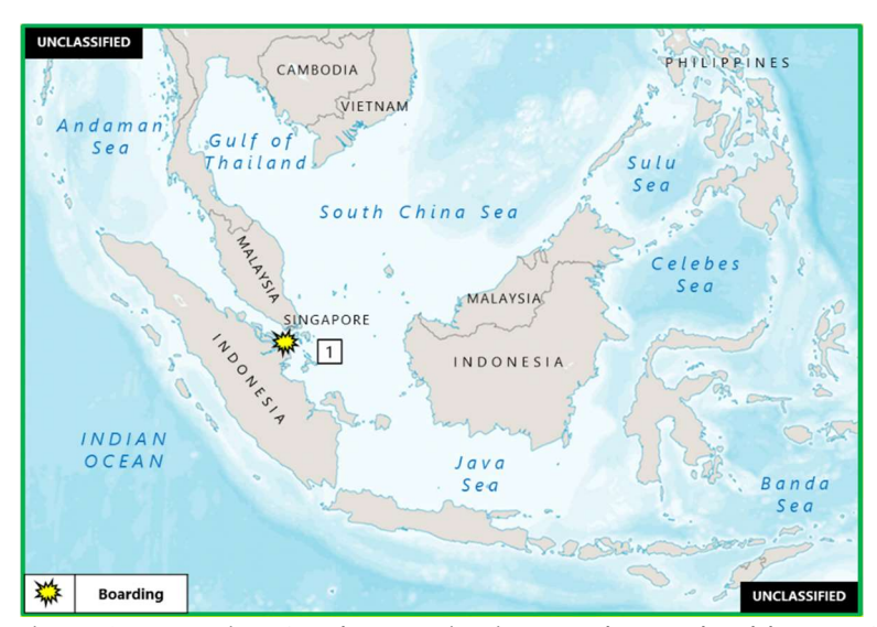
(U) Figure 3. East Asia – Southeast Asia Piracy and Armed Robbery at Sea