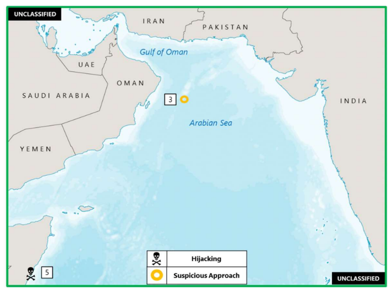
(U) Figure 2. Indian Ocean Piracy and Armed Robbery at Sea