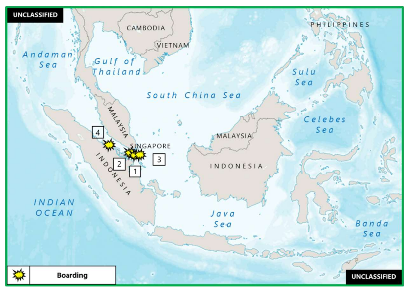
(U) Figure 3. East Asia – Southeast Asia Piracy and Armed Robbery at Sea