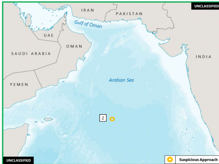
(U) Figure 3. Indian Ocean Piracy and Armed Robbery at Sea