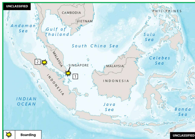
(U) Figure 2. East Asia – Southeast Asia Piracy and Armed Robbery at Sea

1. (U) MALAYSIA: On 6 April at 1645 local time, three unarmed perpetrators boarded the barge LINAU 135 under tow by Malaysia-flagged tug DANUM 53 in the westbound lane of the Singapore Strait Traffic Separation Scheme (TSS), near position 01:18N – 104:15E. The master reported nothing was stolen and the crew was safe. The tug did