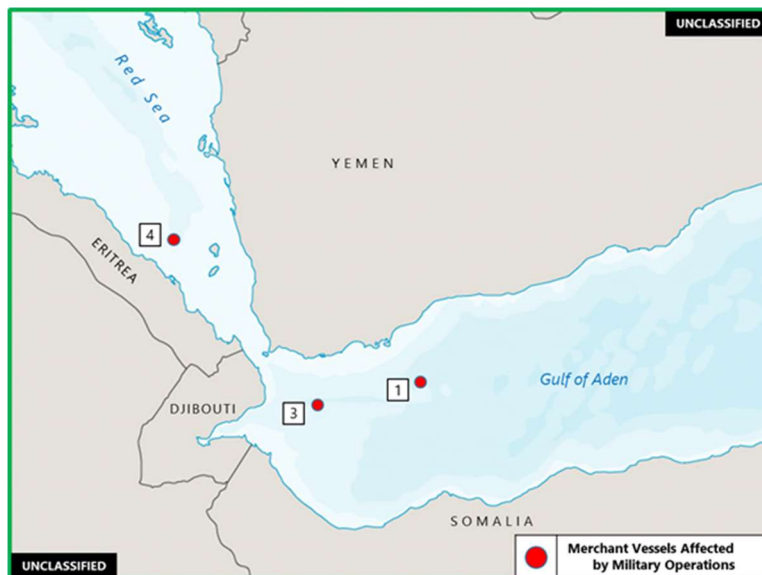
(U) Figure 2. Red Sea – Gulf of Aden Piracy and Armed Robbery at Sea