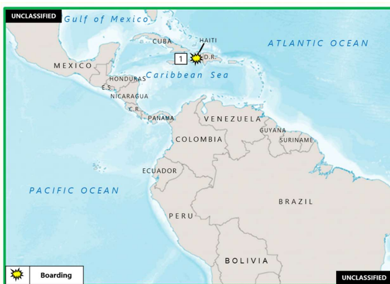
(U) Figure 1. Central America – Caribbean – South America Piracy and Armed Robbery at Sea

1. (U) HAITI: On 4 April at an unspecified time, members of two gangs seized the cargo ship MAGALIE as it departed the Varrreux terminal at the Port-au-Prince Port destined for the northern coastal port of Cap Haitien. The gangs reportedly kidnapped everyone aboard the ship and stole 10,000 bags of rice from the ship's cargo of 60,000 bags. On 6 April, the Coast Guard and Haitian National Police (PNH), with logistical support from the