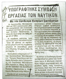
The first Collective Bargaining Agreement for Seafarers' signed on board Cyprus ships in Cyprus (1962 - 1963)

The Cyprus Union of Shipowners provides, in all shipping related matters, a strong voice and represents the interest of its members in Cyprus, Greece, U.K. and other European countries.