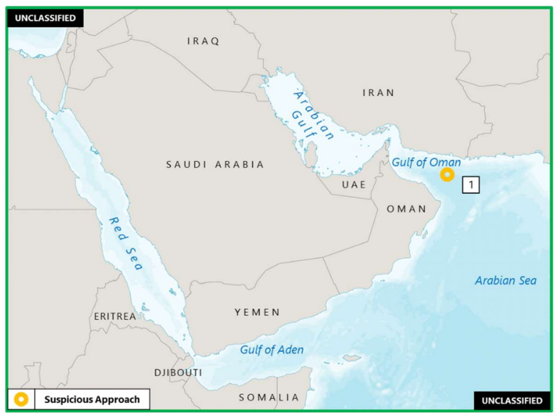
(U) Figure 1. Indian Ocean – East Africa – Red Sea Suspicious Approach