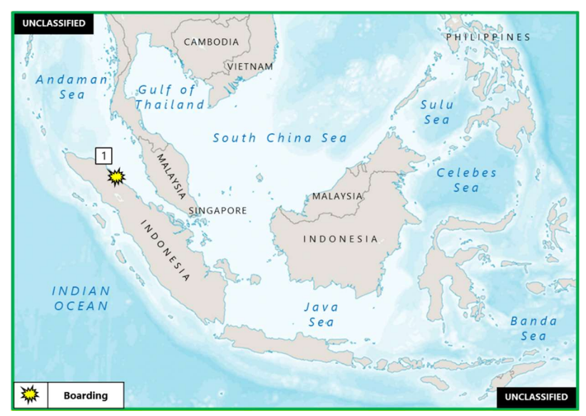
(U) Figure 2. East Asia – Southeast Asia Piracy and Armed Robbery at Sea