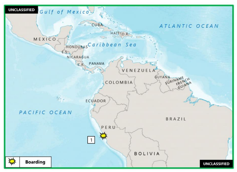
(U) Figure 1. Central America – Caribbean – South America Piracy and Armed Robbery at Sea

1. (U) PERU: On 16 November, two robbers armed with a gun boarded the anchored, Portugal-flagged bulk carrier NORDMOSEL at Callao Anchorage, near position 11:59S – 077:13W and stole ship's stores from the forward station. The ship reported the incident to Callao port authorities. All crew were safe. (IMB; Clearwater Dynamics; vesseltracker.com)