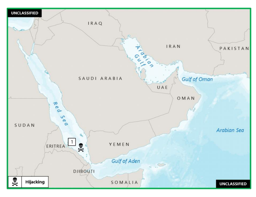
(U) Figure 2. Indian Ocean – East Africa – Red Sea Hijacking