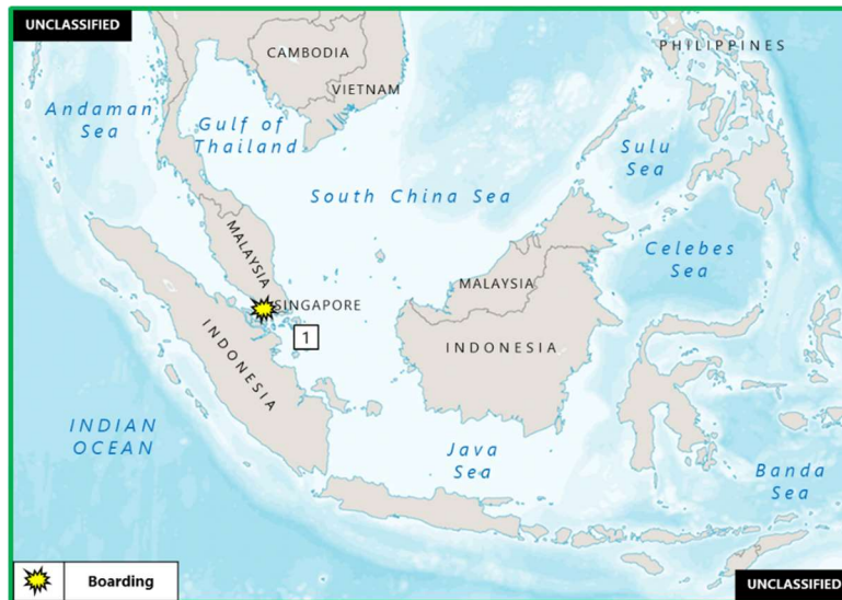
(U) Figure 2. East Asia – Southeast Asia Piracy and Armed Robbery at Sea

1. (U) MALAYSIA: On 26 March at 0854 UTC, four perpetrators in a fishing boat came alongside and boarded a drill ship under tow by an offshore tug in the Malacca Strait, near position 01:26N – 103:11E. The master of the tug requested assistance from the IMB Piracy Reporting Center, who then contacted the Malaysia Maritime Enforcement Agency (MMEA). MMEA dispatched a patrol boat to the vessel's position. A search by the patrol boat did not reveal any perpetrators and the offshore tug and drill ship continued their transit. (IMB; Clearwater Dynamics)