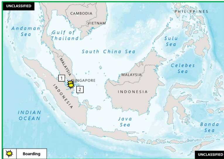
(U) Figure 3. East Asia – Southeast Asia Piracy and Armed Robbery at Sea

1. (U) INDONESIA: On 31 March, four robbers boarded a barge under tow by a tug near Tanjung Balai Karimun in the eastbound lane of the Singapore Strait Traffic Separation Scheme (TSS) (exact position and time not specified). An Indonesian Navy First Fleet quick response team responded to the incident, apprehended the robbers, and recovered ship's stores from the barge. The robbers and evidence were brought to Tanjung Balai Karimun Naval Base for further investigation. (Clearwater Dynamics)