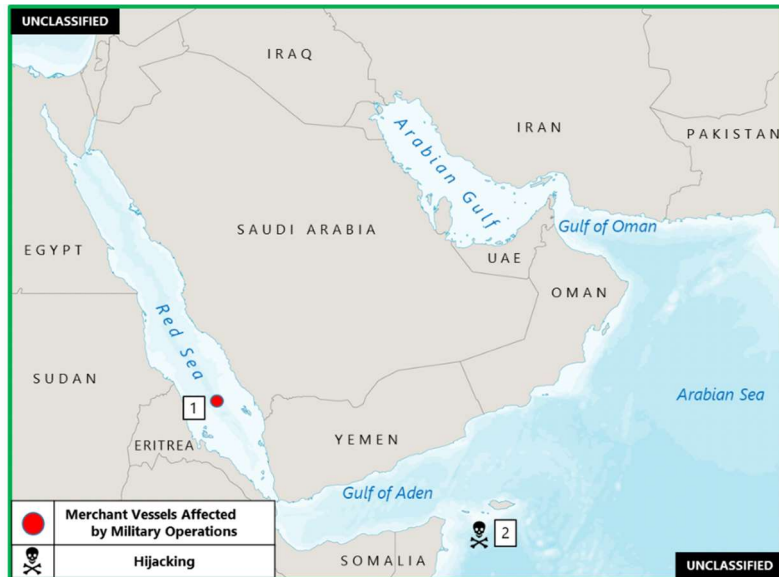
(U) Figure 2. Indian Ocean – East Africa – Red Sea Piracy and Armed Robbery at Sea