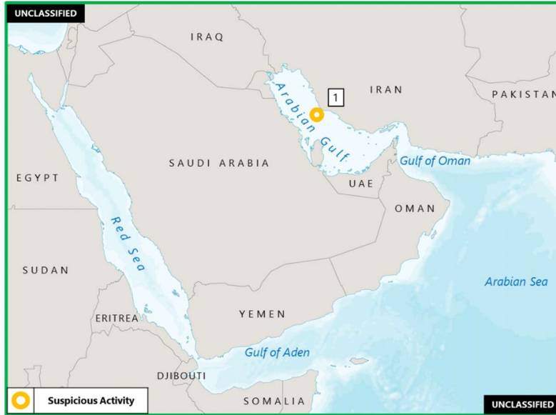
(U) Figure 1. Arabian Gulf Suspicious Activity

1. (U) ARABIAN GULF: Overnight between 2 April 2300 UTC and 3 April 0100 UTC, a vessel experienced a disruption to maritime electronic navigation systems (GPS/AIS) approximately 95 NM east of Ras Al Zour, Saudi Arabia (exact position not specified). (UKMTO)