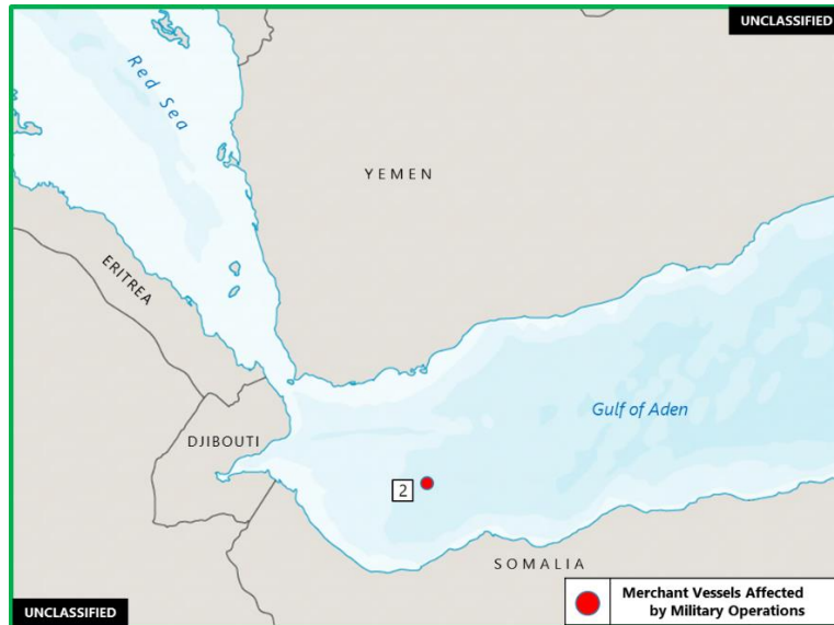
(U) Figure 2. East Africa – Red Sea Piracy and Armed Robbery at Sea