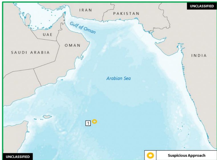
(U) Figure 3. Arabian Sea Piracy and Armed Robbery at Sea

1. (U) ARABIAN SEA: On 8 May at an unspecified time, a small fast boat with three persons onboard approached a merchant vessel while underway approximately 350 NM east of Socotra, Yemen, near position 11:49N – 060:32E. Following the approach, the boat turned away and returned to a 30-meter fishing vessel that had another three speedboats located at its stern. All vessels appeared to be acting together. No weapons or ladders were observed. (Clearwater Dynamics)