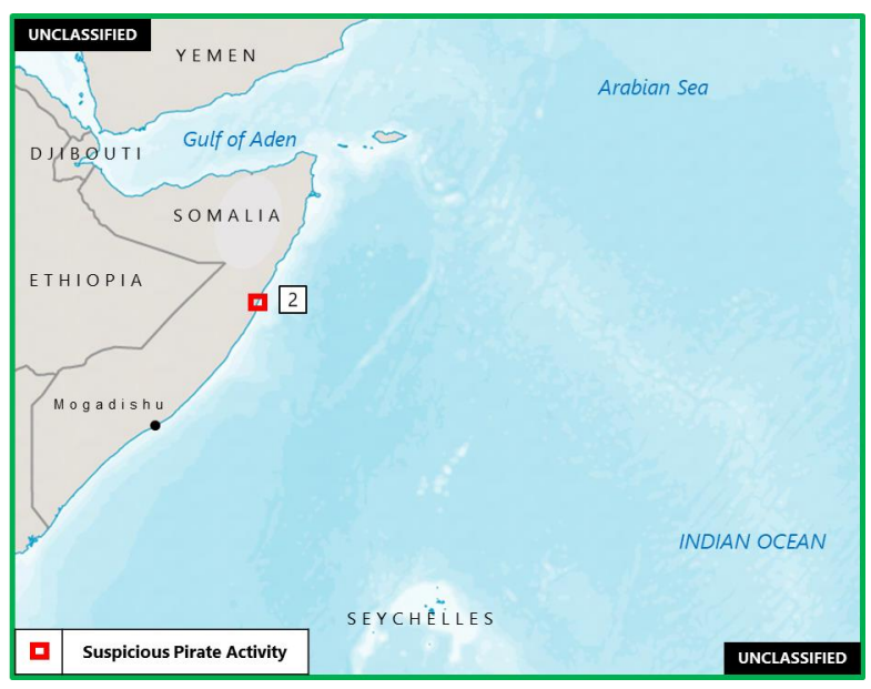
(U) Figure 3. Arabian Sea Suspicious Activity

1. (U) RED SEA: On 17 May at 2200 UTC, an antiship ballistic missile (ASBM) launched from Huthi-controlled territory in Yemen targeted the Panama-flagged oil tanker WIND while underway approximately 98 NM south of Hodeida, Yemen (exact position not specified). The ASBM struck the tanker and the impact caused flooding that resulted in the loss of its propulsion and steering. A coalition vessel quickly responded to WIND's distress call, but