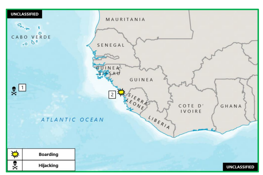
(U) Figure 1. West Africa Piracy and Armed Robbery at Sea

1. (U) WEST AFRICA: On 17 May at 0410 UTC, 10 pirates armed with AK-47 automatic rifles hijacked the Palau-flagged product tanker FIDAN while underway approximately 363 NM south-southwest of Nova Sintra, Cabo Verde, and approximately 700 NM off the coast of West Africa, near position 09:11N – 027:03W. The pirates took