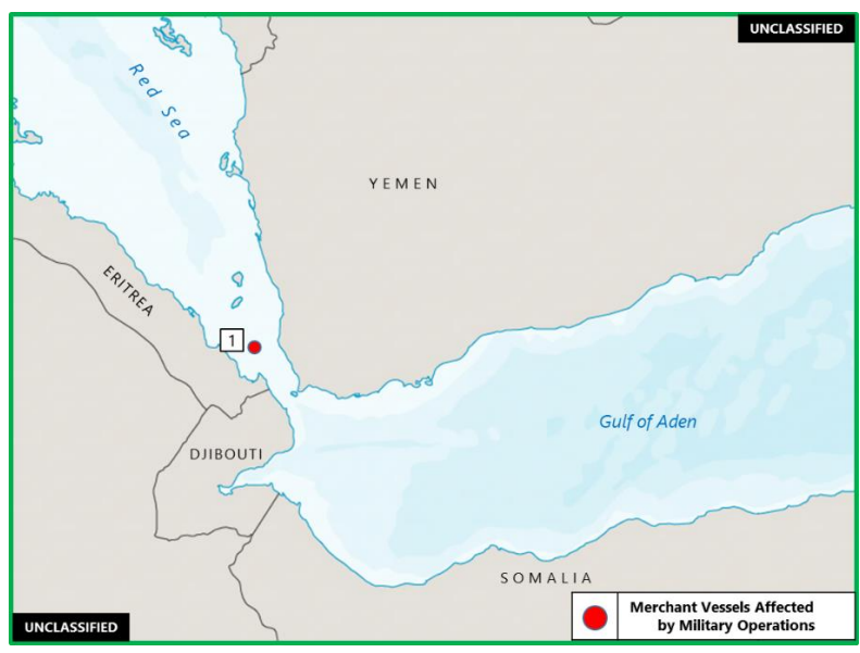
(U) Figure 2. East Africa Piracy and Armed Robbery at Sea