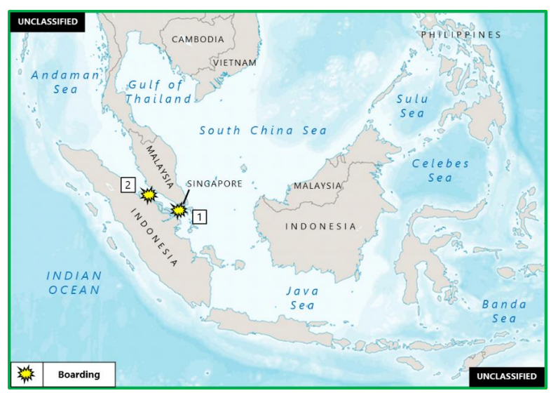
(U) Figure 4. Southeast Asia Piracy and Armed Robbery at Sea