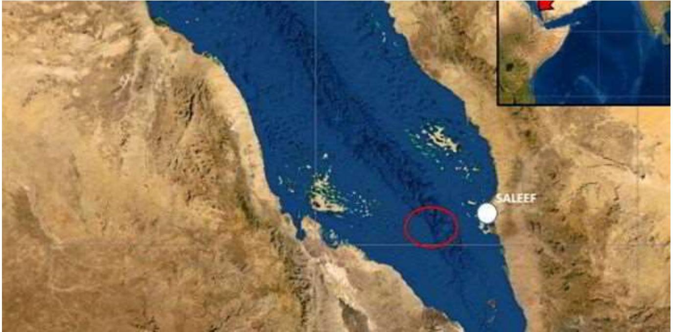
A UKMTO map showing the approximate location of the latest series of attacks in the Red Sea.