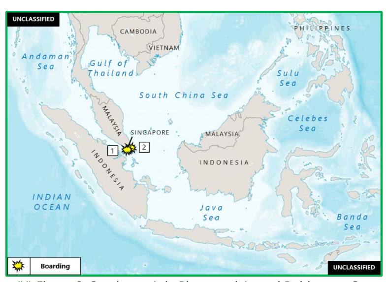
(U) Figure 3. Southeast Asia Piracy and Armed Robbery at Sea