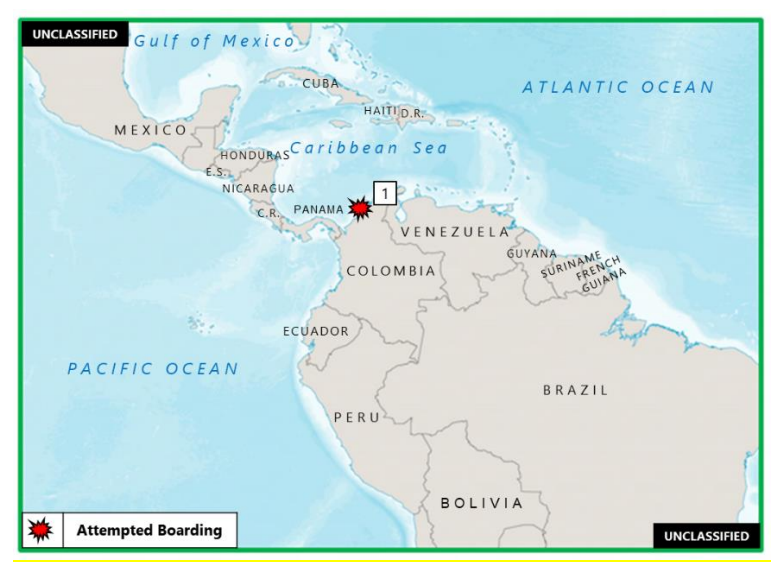
(U) Figure 1: South America Piracy and Armed Robbers at Sea

1. (U) COLOMBIA: On 28 August at 0130 local time, one perpetrator attempted to board an anchored Denmark-flagged LPG tanker at Cartagena Inner Anchorage, near position 10:19N – 075:32W. The duty crew observed four perpetrators in a boat near the anchor chain and another in the hawsepipe. The officer on watch was alerted to the presence of the perpetrators and the fire pumps were activated. Seeing the crew's alertness, the perpetrators escaped. The vessel notified port control and the coast guard investigated the area around the tanker. (Clearwater Dynamics; IMB)