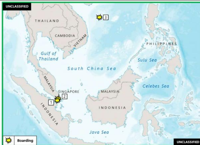
(U) Figure 3. Piracy and Armed Robbery at Sea in Southeast Asia