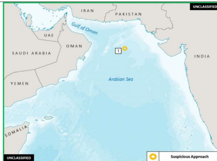
(U) Figure 1. Suspicious Approach in the Arabian Sea