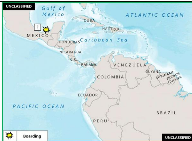
(U) Figure 1. Piracy and Armed Robbery in the Gulf of Mexico