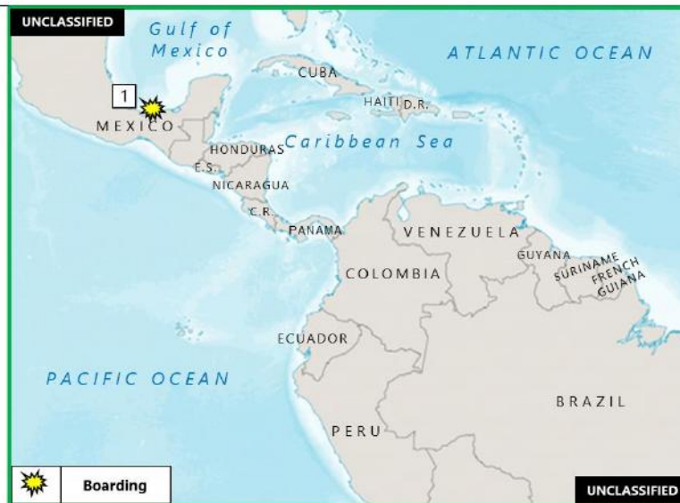
(U) Figure 1. Piracy and Armed Robbery at Sea in the Gulf of Mexico