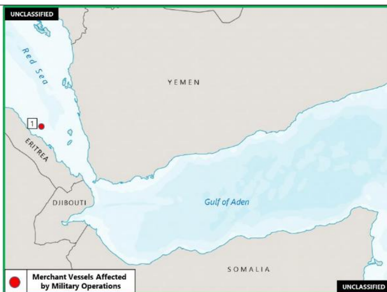
(U) Figure 2. Red Sea Military Operations against Merchant Vessels