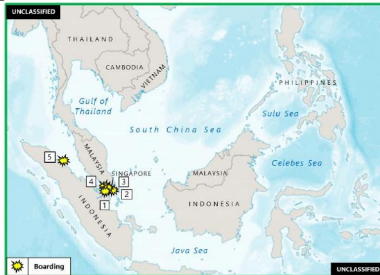
(U) Figure 3. Piracy and Armed Robbery at Sea in Southeast Asia