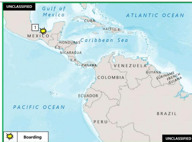
(U) Figure 1. Piracy and Armed Robbery at Sea in the Gulf of Mexico