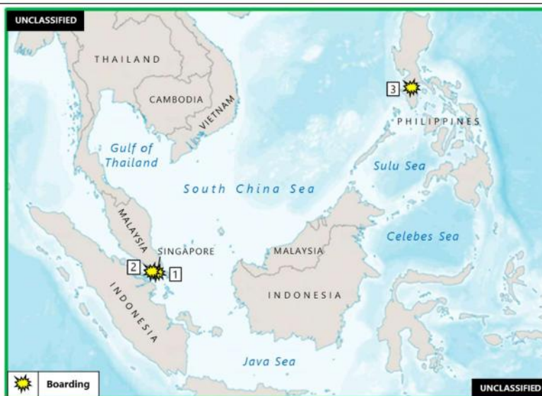
(U) Figure 3. Piracy and Armed Robbery at Sea in Southeast Asia