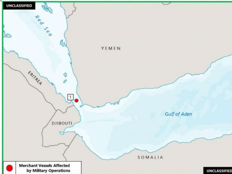
(U) Figure 2. Merchant Vessel Affected by Military Operations in the Red Sea