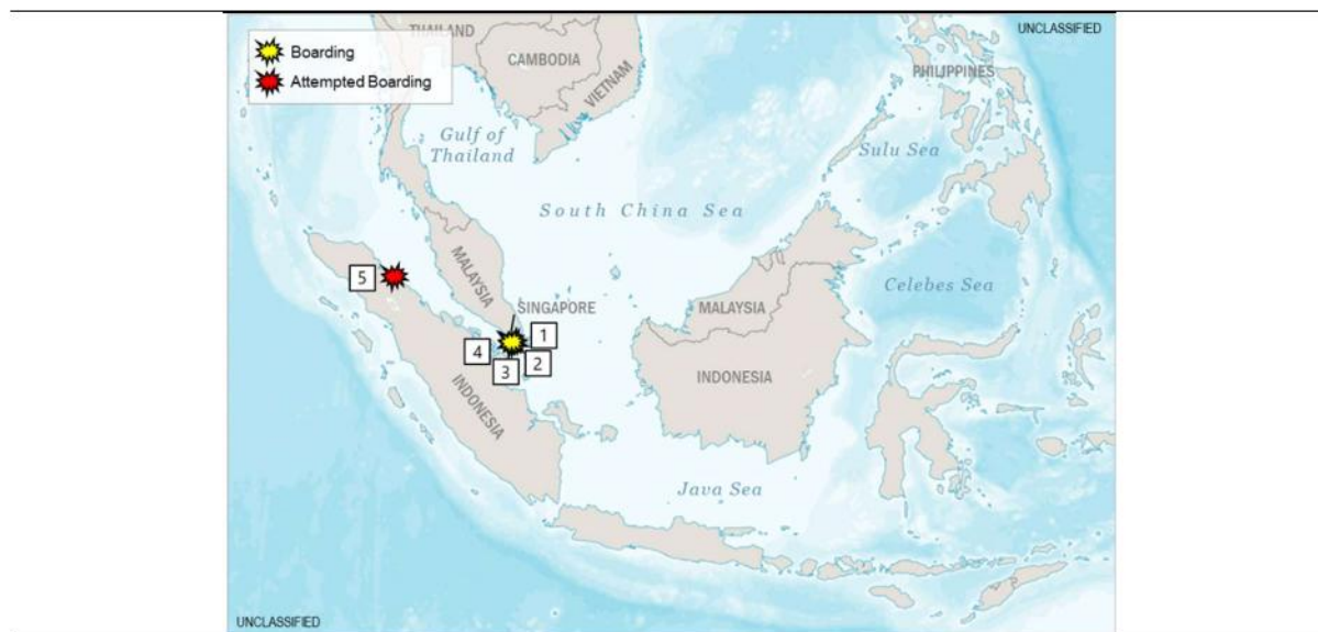
(U) Figure 2. Piracy and Armed Robbery at Sea in Southeast Asia