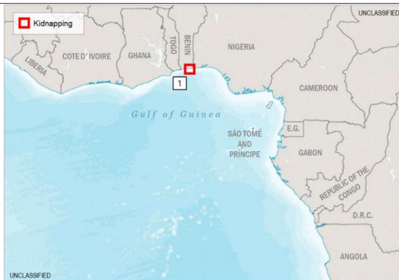
(U) Figure 1. Piracy and Armed Robbery at Sea in West Africa – Gulf of Guinea