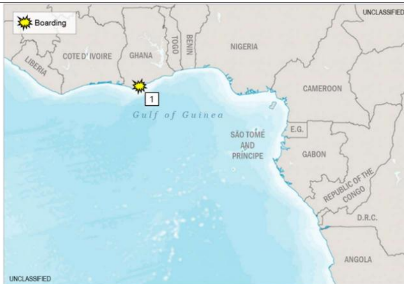
(U) Figure 1. Piracy and Armed Robbery at Sea in West Africa – Gulf of Guinea