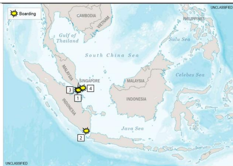
(U) Figure 2. Piracy and Armed Robbery at Sea in Southeast Asia