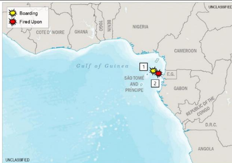
(U) Figure 1. Piracy and Armed Robbery at Sea in West Africa – Gulf of Guinea