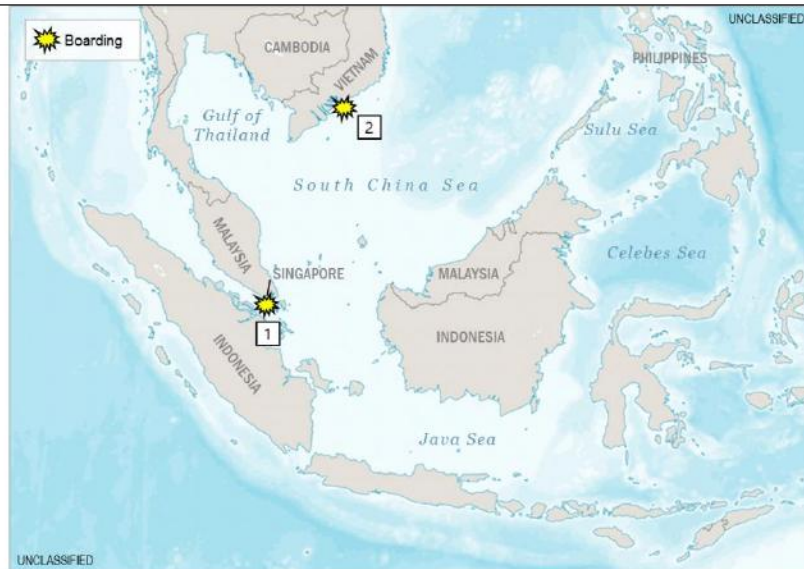
(U) Figure 2. Piracy and Armed Robbery at Sea in Southeast Asia