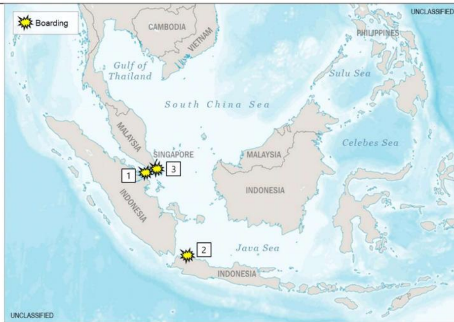
(U) Figure 3. Piracy and Armed Robbery at Sea in Southeast Asia