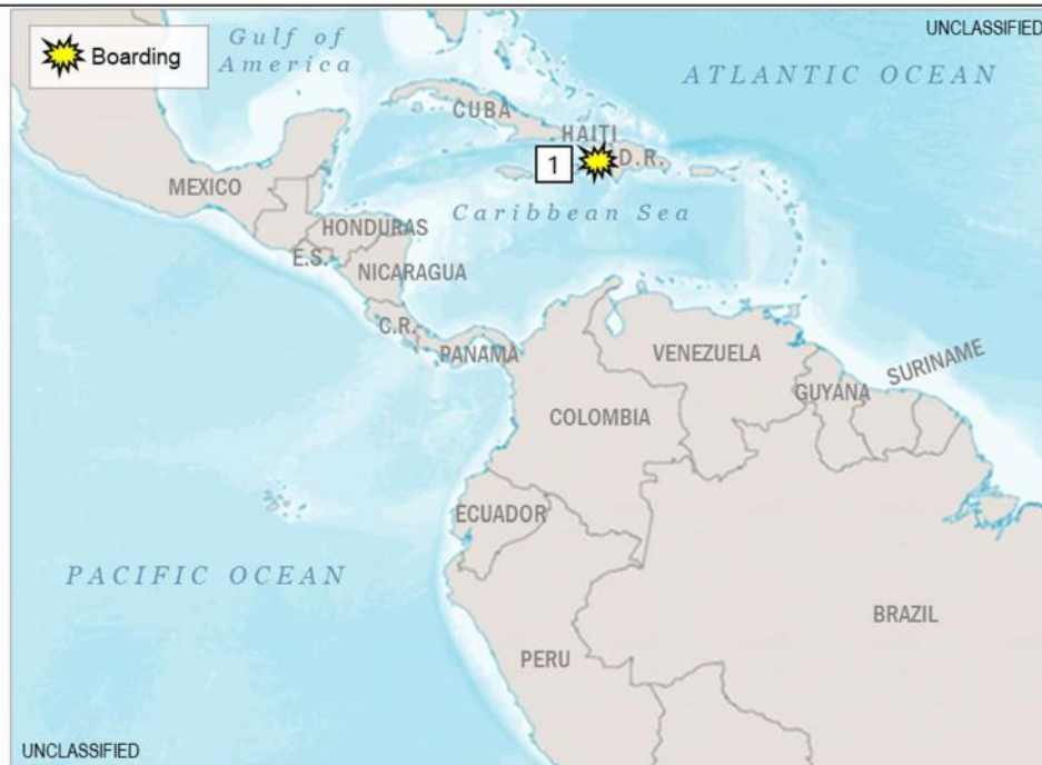
(U) Figure 1. Piracy and Armed Robbery at Sea in the Caribbean