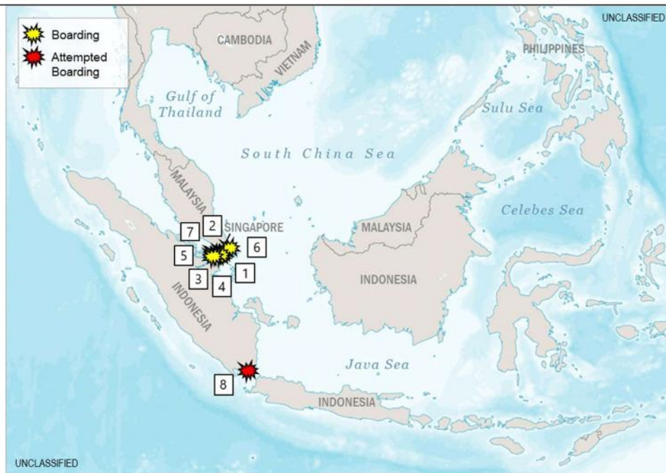
(U) Figure 4. Piracy and Armed Robbery at Sea in Southeast Asia