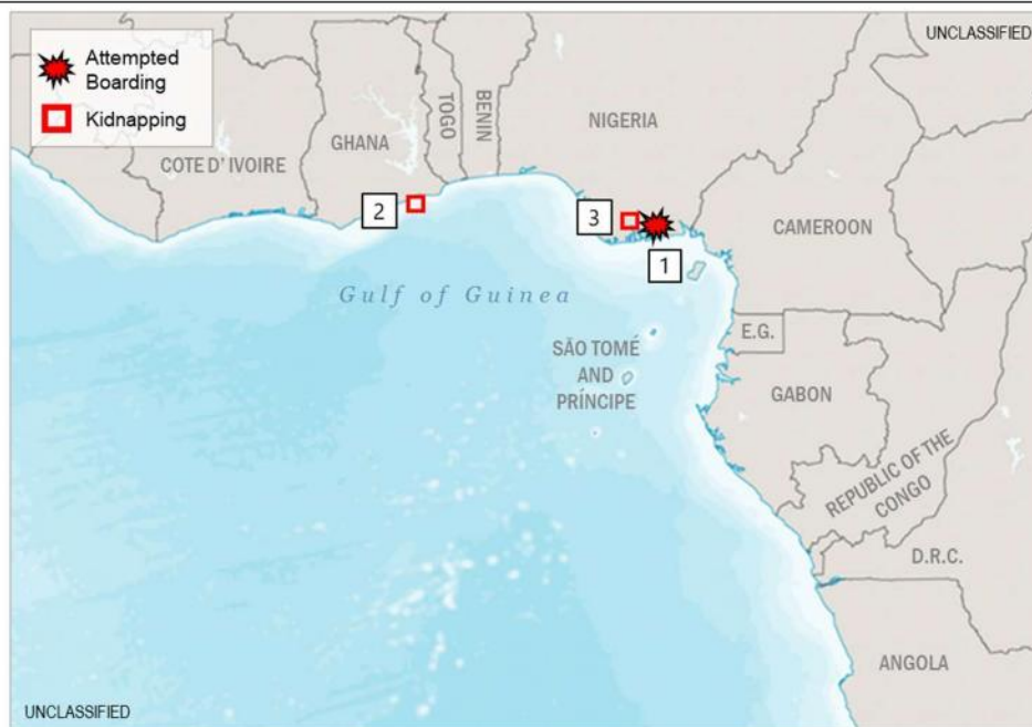
(U) Figure 2. Piracy and Armed Robbery at Sea in Gulf of Guinea