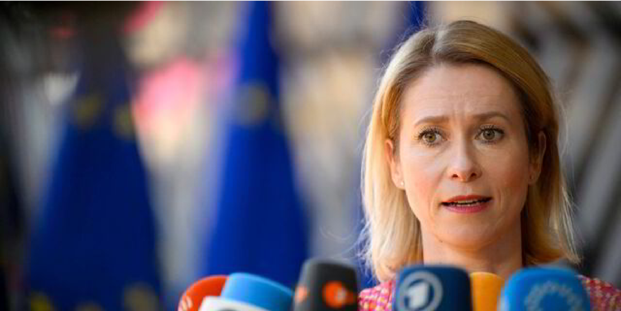
EU foreign policy chief Kaja Kallas said the package unveiled on Tuesday was the largest targeting Russia's shadow fleet.