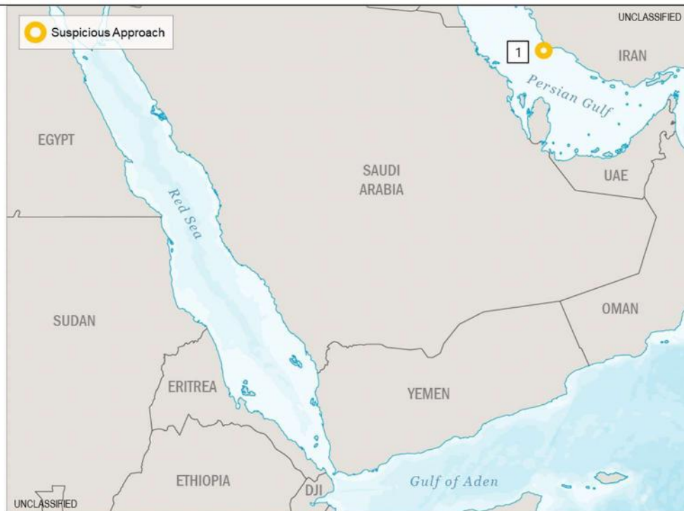
(U) Figure 1. Suspicious Approach in the Persian Gulf