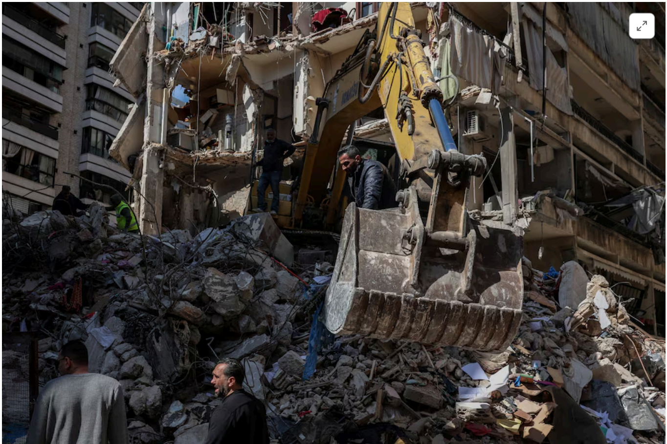
[1/10] Emergency services operate at the site of an Israeli strike carried out on Wednesday, in Ain Al Mraieeh in Beirut, Lebanon, April 9, 2026.