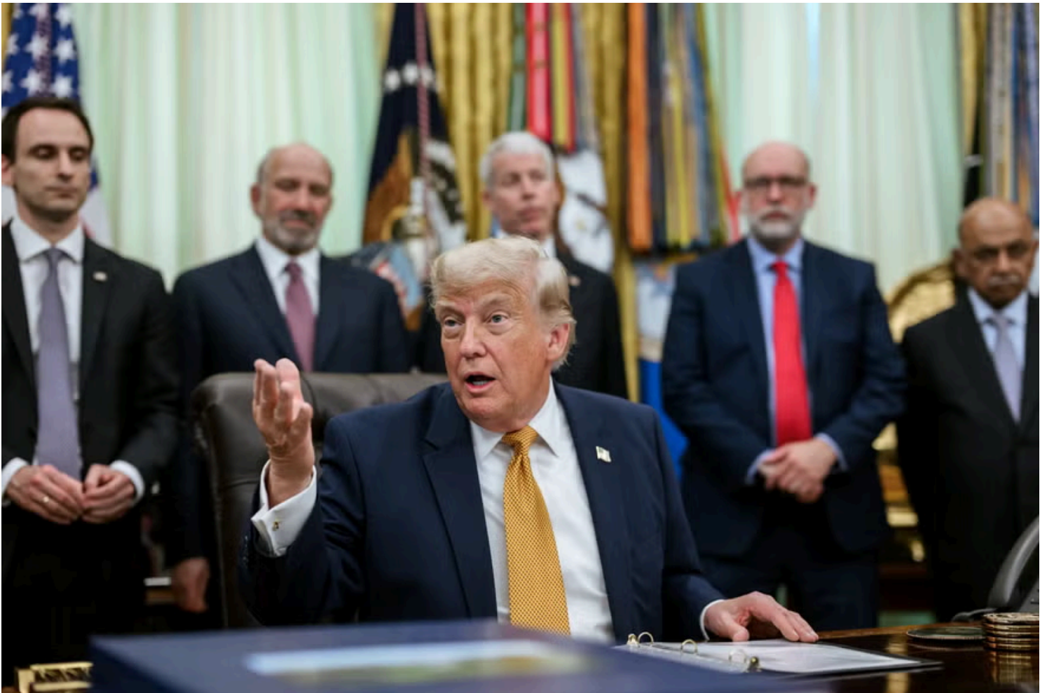
President Donald Trump delivers remarks after signing an Executive Order on quantum computing in the Oval Office on Monday.

The United Nations shipping regulator put its plan on hold on Thursday after an attack on Evergreen's 8,508-teu Ever Lovely (built 2015) off the coast of Oman.