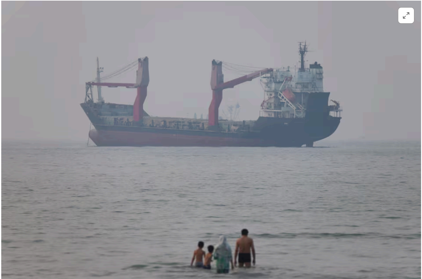
[1/5] A vessel in the Strait of Hormuz near the beach of Bandar Abbas, Iran, June 30, 2026.

Trump's son-in-law Jared Kushner and top U.S. envoy Steve Witkoff, dispatched to the region for what the White House had billed as "high-level" talks, did not attend the sessions, according to a source who spoke on condition of anonymity.